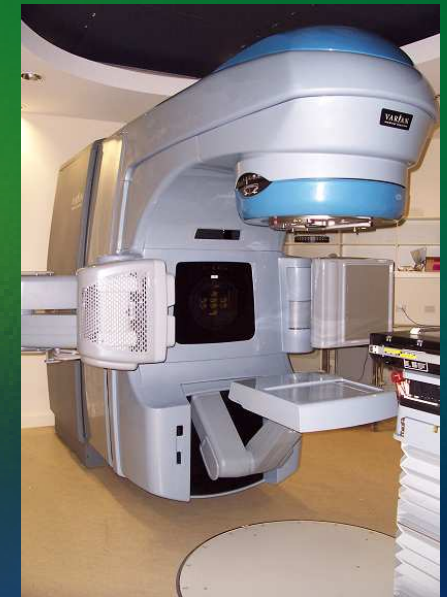
Modern external beam linear accelerator

Registration fees: $10 ACPSEM members, $15 non-members, payable on the day.